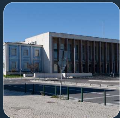
Universidade de Lisboa