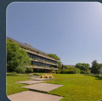
Calouste Gulbenkian Foundation