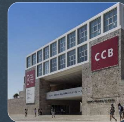
Centro Cultural de Belém